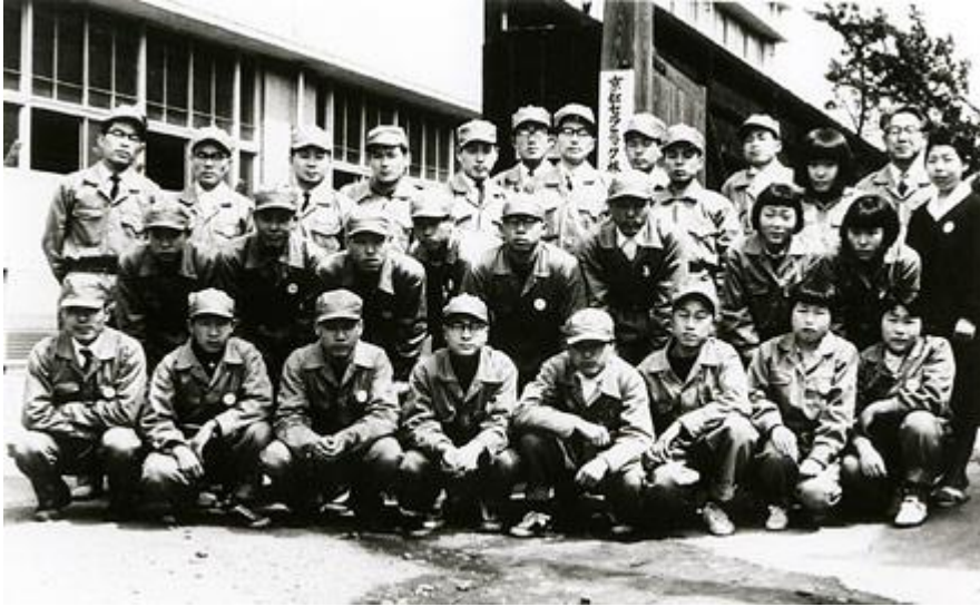
Employees in 1959: 28